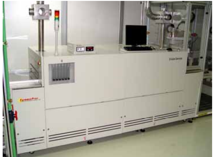
Furnace shown integrated with production line

The compact LA-309 is a general purpose furnace. Process atmosphere is controlled much like a clean room: pressurized gas is pushed through the heating chamber insulation providing a pre-heated, laminar flow for a uniform, stable atmosphere. Precise temperature is maintained by control thermocouples above the belt in each zone quickly sensing changing conditions. IR quartz heating lamps inside the chamber instantaneously adjust their output to achieve tight temperature control: each load through the furnace sees the same temperature.